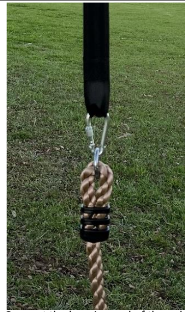
1. Hang the nylon strap centered on the |2. Connect the hanging end of the nylon |3. Good to go! carabiner to the metal ring on the swing.