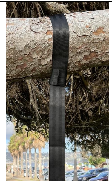
tree branch. Pass one end of the nylon strap to the carabiner. Connect the strap through the opening of the other end. Pull snug such that the strap is looped around and fully contacting the branch